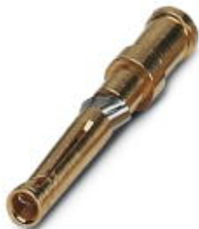
Turned 1.6 crimp contact, individual female contact, core diameter 0.14 to 0.37 mm 2 , gold-plated

Please be informed that the data shown in this PDF Document is generated from our Online Catalog. Please find the complete data in the user's documentation. Our General Terms of Use for Downloads are valid ( http://phoenixcontact.com/download )