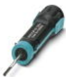
Assembly tool, for CK 1.6... crimp contacts for small conductor cross sections

Assembly tool - UNIFOX MT-CK 1.6/2.5 - 1089092