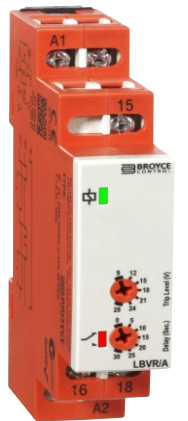
Dims: to DIN 43880 W. 17.5mm