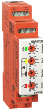
Dims: to DIN 43880 W. 17.5mm