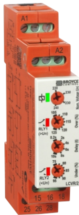
Dims: to DIN 43880 W. 17.5mm