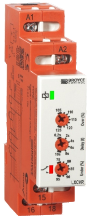
Dims: to DIN 43880 W. 17.5mm