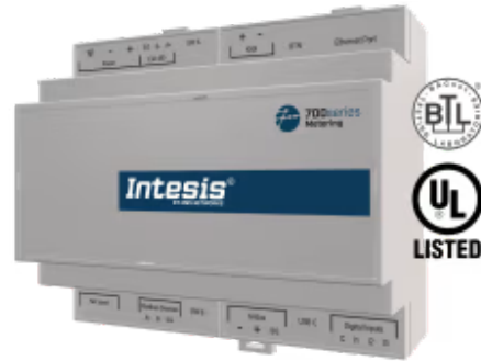
M-Bus, Modbus, and Digital Pulses to BACnet - Up to 60 meters

Enable fast and cost-effective integration of Modbus devices and meters, M-Bus meters, and pulse meters into BACnet/IP and/or MS/TP systems. Built-in M-Bus level converter and auto-discovery features reduce setup time and simplify commissioning.