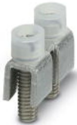
Fixed bridge, Number of positions: 2, Color: silver

Please be informed that the data shown in this PDF Document is generated from our Online Catalog. Please find the complete data in the user's documentation. Our General Terms of Use for Downloads are valid ( http://phoenixcontact.com/download )