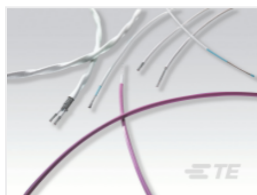
TE Part #CAT-AS22759-32 SAE AS22759: 32/33/44/45/46 - Single-Wall, Lightweight Wire