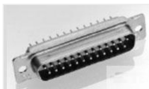
TE Part #206801-2 AMPLIMITE RECEPT ASY,25 POS