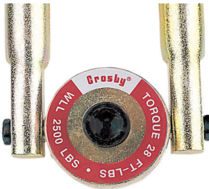
HR-125 Swivel Hoist Ring