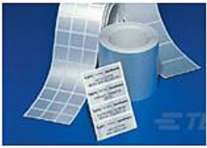
TE Part #E41599-000 MP-762381-2.5-8A