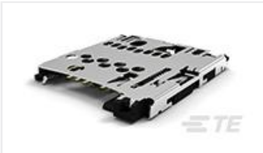
TE Part #2201778-1 MICRO SD PUSH PUSH LOW PROFILE TYPE