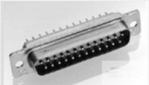
TE Part #1757823-8 AMPLIMITE,ASY,PLUG,STD,90,ZN,2,CT