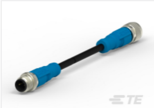
TE Part #T4152113002-001 RPC-M12-2MS-0.5-M12-2FS-PVC