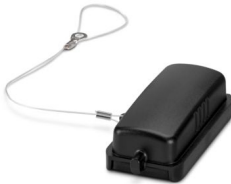
Protective cover D15, for single locking latch, protective cover material: PC, height: 19 mm, seal: yes

Please be informed that the data shown in this PDF document is generated from our online catalog. Please find the complete data in the user documentation. Our general terms of use for downloads are valid.