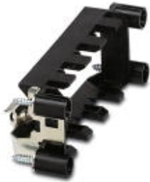
Sleeve frame, with PE connection to housing, for contact insert modules, type 1, number of insert modules: 2

Please be informed that the data shown in this PDF Document is generated from our Online Catalog. Please find the complete data in the user's documentation. Our General Terms of Use for Downloads are valid ( http://phoenixcontact.com/download )