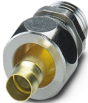
Cable gland made from brass with Pg thread, IP65 protection

Please be informed that the data shown in this PDF document is generated from our online catalog. Please find the complete data in the user documentation. Our general terms of use for downloads are valid.