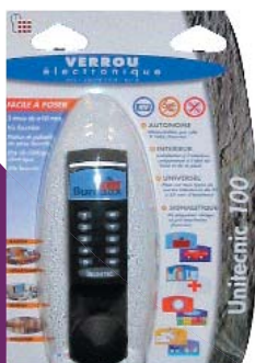
Presentation packing also available.