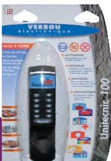
Presentation packing also available.