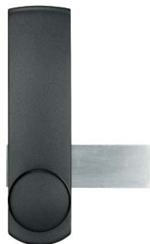
Unitecnic 120 Inside