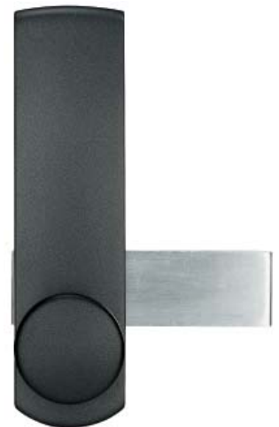
Unitecnic 130 Inside