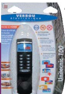
Presentation packing also available.