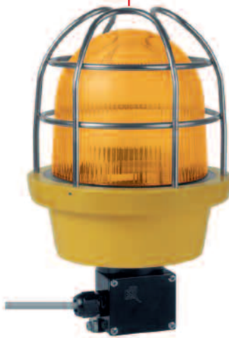
Ex LED Rotating Beacon with wire guard (accessory)