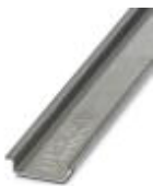
DIN rail, unperforated, Width: 35 mm, Height: 7.5 mm, Length: 2000 mm, Color: silver

DIN rail, unperforated - NS 35/ 7,5 AL UNPERF 2000MM - 0801704