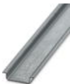
DIN rail, material: Galvanized, unperforated, height 7.5 mm, width 35 mm, length: 2 m

DIN rail, unperforated - NS 35/ 7,5 ZN UNPERF 2000MM - 1206434