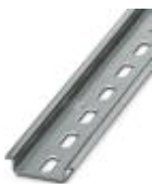
DIN rail, material: Galvanized, perforated, height 7.5 mm, width 35 mm, length: 2 m

DIN rail perforated - NS 35/ 7,5 ZN PERF 2000MM - 1206421