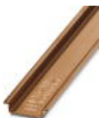
DIN rail, material: Copper, unperforated, height 7.5 mm, width 35 mm, length: 2 m

DIN rail, unperforated - NS 35/ 7,5 CU UNPERF 2000MM - 0801762