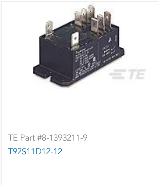
TE Part #8-1393211-9 T92S11D12-12