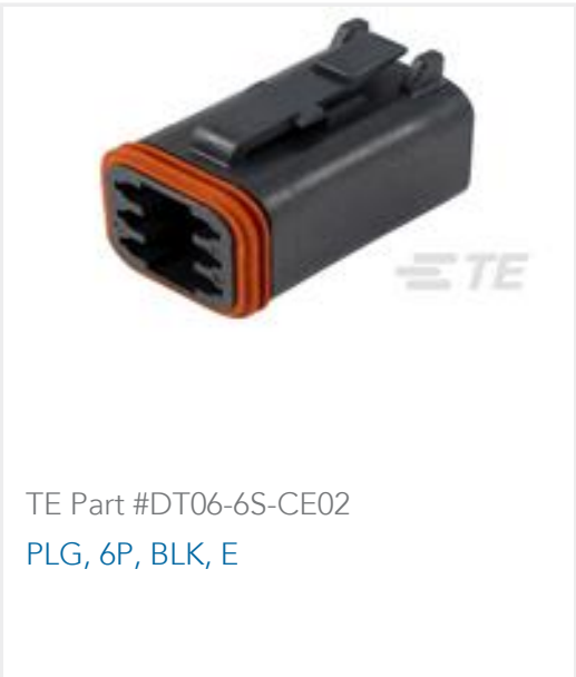
TE Part #DT06-6S-CE02 PLG, 6P, BLK, E