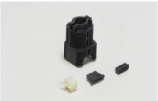
Rectangular Connector Housings(5)