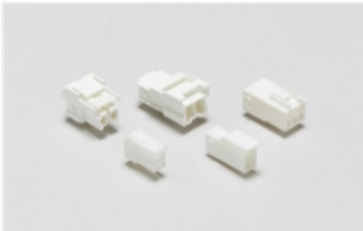
Rectangular Power Connectors(7)