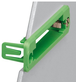
Panel-mount frame, color: green, product range: IC-DFR, width: 33.83 mm, This assembly frame can only be used in combination with IC 2,5/...-STGF-5,08

Please be informed that the data shown in this PDF document is generated from our online catalog. Please find the complete data in the user documentation. Our general terms of use for downloads are valid.