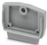
End cover, Length: 32 mm, Width: 4 mm, Color: gray