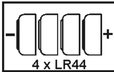
Fig. 5.1. Correct battery placement