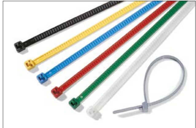
The LR55 cable ties are reusable and ideal for colour coding.