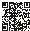
Application video: LR55

Minimum Order Quantity (MOQ) may differ from package content. Other packaging options may also be available.