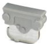
Feed-through connector, Length: 10.5 mm, Width: 4 mm, Color: gray

Feed-through connector - P-FIX - 3038956