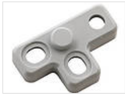
Wall brackets, screw-on at rear