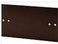
Mounting plates, laminated paper (Pertinax), galvanised steel for version 260

For EM/ET 214, EM/ET 221-223, EM/ET 232, EM/ET 237, BCD 200, B 2213..