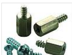
Screws (SHR) and distance bolts (DIBLZ) for mounting bosses in plastic enclosures

For EM/ET 221, EM/ET 237, M/T 221, M/T 237