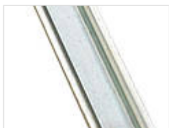
DIN rail acc. to DIN EN 60715 TH 15