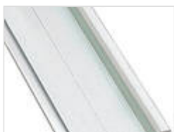
DIN rail acc. to DIN EN 60715 TH 35

For EM/ET 214, EM/ET 221-223, EM/ET 232, EM/ET 237, B 22130.