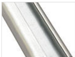
DIN rail acc. to DIN EN 60715 G 32

For EM/ET 214, EM/ET 221-223, EM/ET 232, EM/ET 237, BCD 200, B 2213..