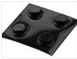
Rubber feet, self-adhesive