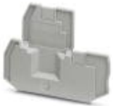
End cover, Length: 74.3 mm, Width: 2.2 mm, Height: 66 mm, Color: gray