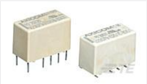
TE Part #1393788-3 V23079A1001B301