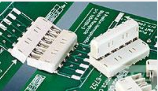
TE Part #1954289-2 Connector,Blade & Recept 4 Pos