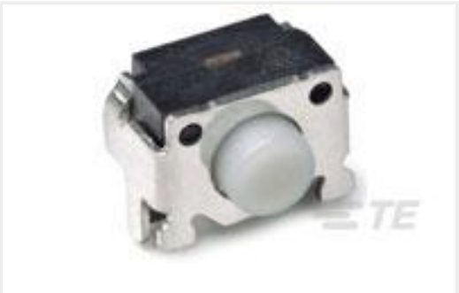
TE Part #1977066-1 FSMMSHP=R/A TACT SWITCH, SMT W/LOC. PEGS