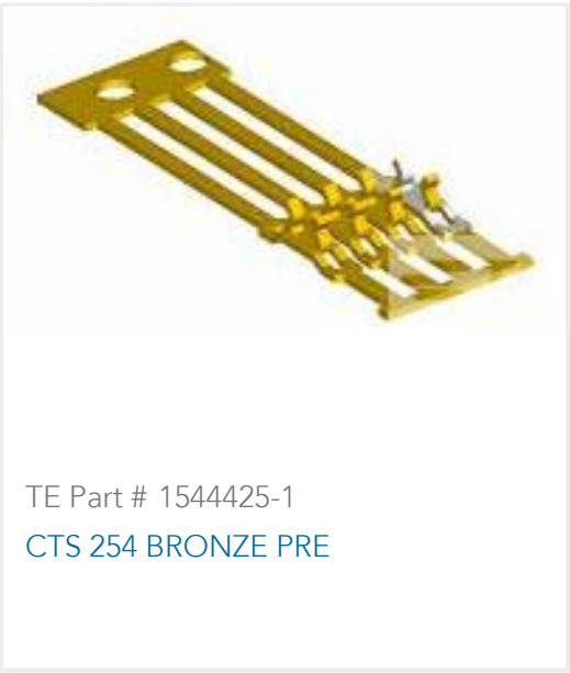
TE Part # 1544425-1 CTS 254 BRONZE PRE