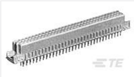
TE Part #535032-4 096 EURO TYPE C RECEPT AP ASSY