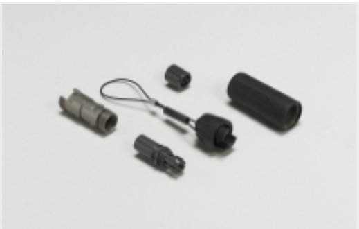
Expanded Beam Fiber Housings(5)