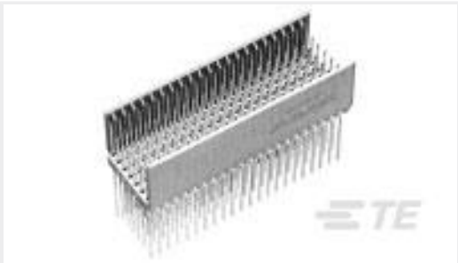
TE Part #5352128-1 Z-PACK T-B MALE HEADER 154P