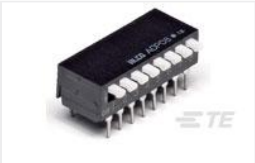
TE Part #1571999-4 ADP02STR04=PIANO DIP SWITCH