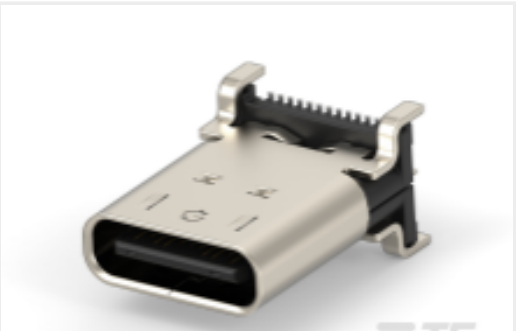
TE Part #2337857-1 VERTICAL USB TYPE-C REC