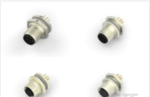
TE Part #CAT-C73765-M1H M12 Panel Mount PCB