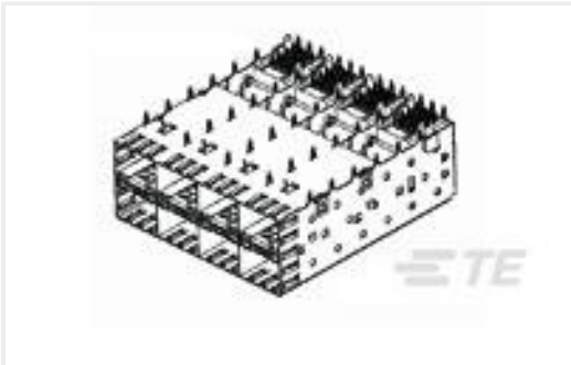
TE Part #2170286-1 PRESS FIT 2X4 REDUCED PROFILE