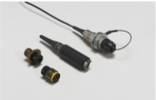
Expanded Beam Fiber Optics(14)