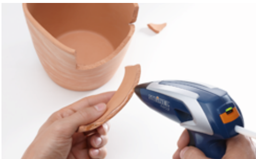
Example application 5