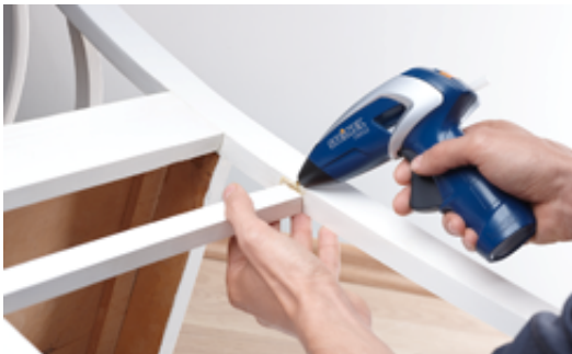
Example application 4