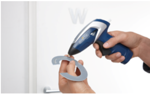
Example application 2