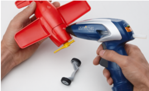
Example application 3