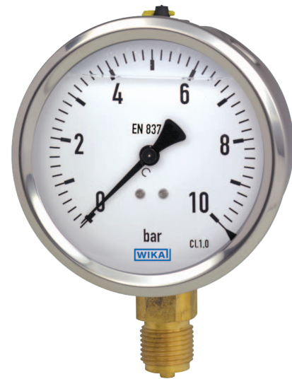
Bourdon tube pressure gauge, model 213.53.100, lower mount