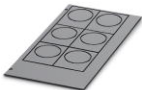
The figure shows the product version EMLP 32 (38X14) SR

Plastic label with drill hole, Card, silver, unlabeled, can be labeled with: Engraving, Plotter, Mounting type: Adhesive, Lettering field: 30 x 12 mm