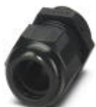
Cable gland, Cable gland material: Polyamide 6, External cable diameter 11 mm ... 17 mm, Shielding: No, Connecting thread: M25

Cable gland - G-INS-M25-M68N-PNES-BK - 1411134