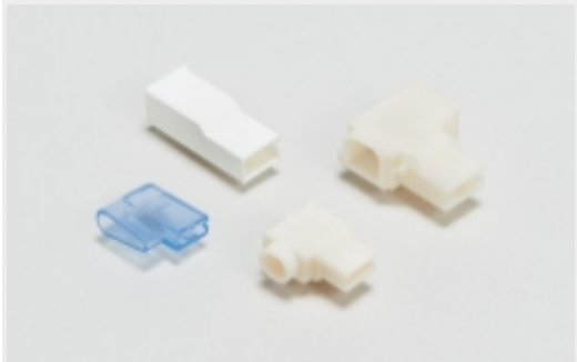
Crimp Terminal Housings(195)

requirements for substances in articles' posted at this URL: https://echa.europa.eu/guidance-documents/guidance-on-reach