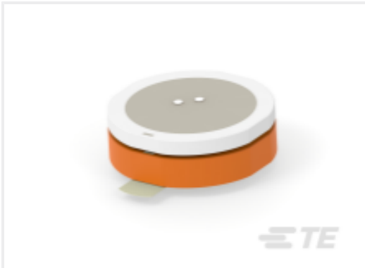
TE Part #2108840-1 Ceramic patch ant, L1+G1 & L2+E5b