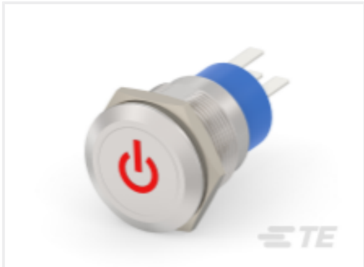
TE Part #2-2213766-5 AV19 SPL 3A POWER LED RED 12V