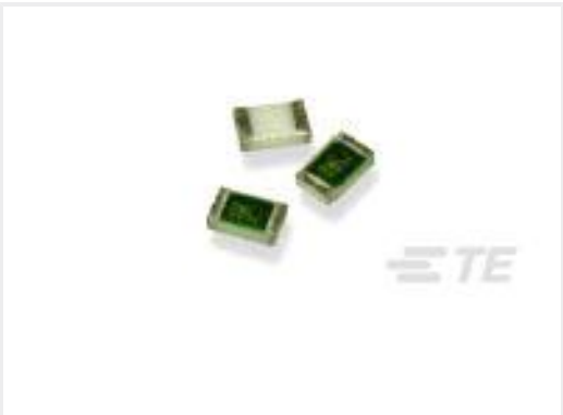
TE Part #9-1879334-7 CPF 0603 20R 1% 50PPM 1K RL