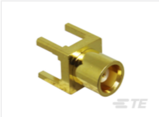
TE Part #CONMCX001 MCX Jack 50 Ohm PCB Through Hole