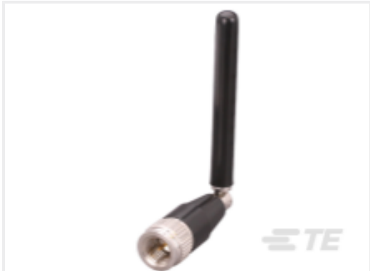
TE Part #ANT-LTE-MON-SMA-E Antenna MON-E LTE/GPS Swivel SMA