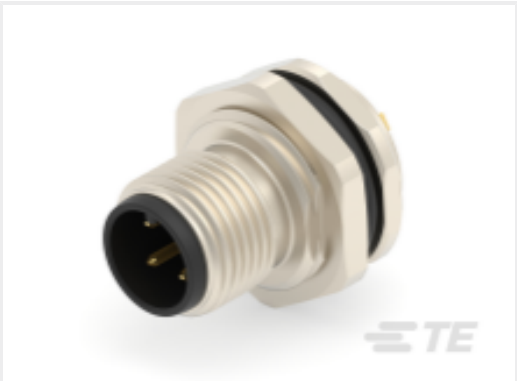
TE Part #T4130012041-000 M12,REAR MOUNT,MALE,A,4P, SOLDER WIRE