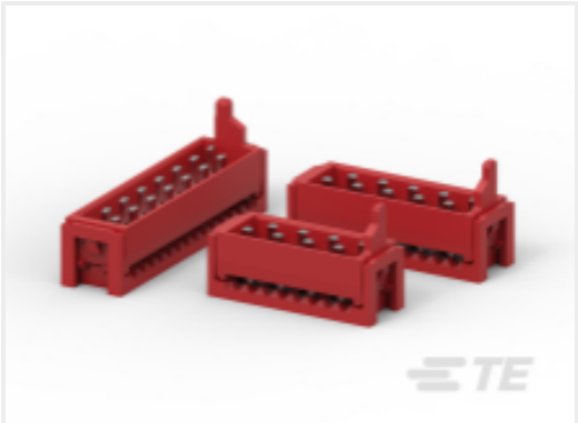
TE Part #CAT-M5833-M2934A Male-on-Wire Connector, Micro-MaTch