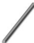
Connection pin, Color: black

Connection pin - VS-UK 10,3-HESI N 3POL - 3048409