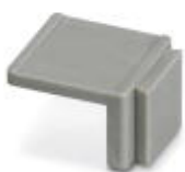
Equipment marker, narrow

Marking material - EMG-SGKS 10 - 2947585