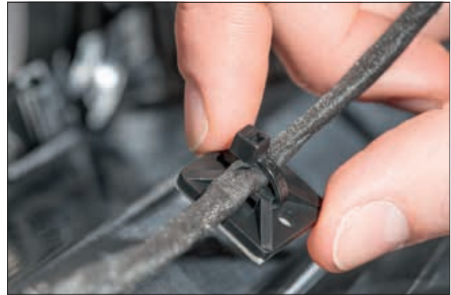
SolidTack MB Series mounts with square design - screwable, self-adhesive - suitable for a wide range of applications like fastening of cables in the automotive machinery.