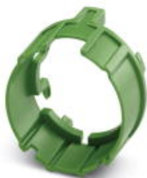
Circular connectors (cable-side), Range of articles: PRC, Coding element, color: green

Please be informed that the data shown in this PDF Document is generated from our Online Catalog. Please find the complete data in the user's documentation. Our General Terms of Use for Downloads are valid ( http://phoenixcontact.com/download )