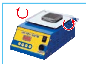
Loosen the screw on both sides.