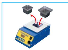
Change the pot and tighten the screws.

* For your safety, be sure to replace the pot after the solder completely cools.