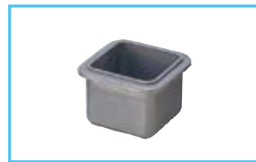
Specially coated solder pot