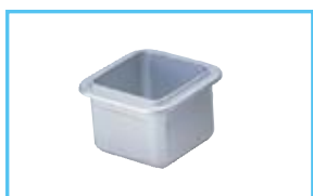
Standard solder pot

The special coating prevents the solder pot from corroding, which ensures that the solder pot has a long service life.