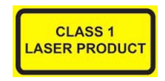
Figure 4. Class 1 laser product label

The VL6180 contains a laser emitter and corresponding drive circuitry. The laser output is designed to remain within Class 1 laser safety limits under all reasonably foreseeable conditions, including single faults, in compliance with the IEC 60825-1:2007. The laser output remains within Class 1 limits as long as the STMicroelectronics recommended device settings are used and the operating conditions specified in the datasheet are respected. The laser output power must not be increased and no optics should be used with the intention of focusing the laser beam.