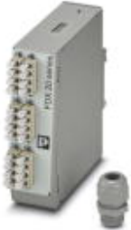
DIN rail splice box, fully mounted ready to splice, for 12x LC duplex (OM4)

Please be informed that the data shown in this PDF Document is generated from our Online Catalog. Please find the complete data in the user's documentation. Our General Terms of Use for Downloads are valid ( http://phoenixcontact.com/download )