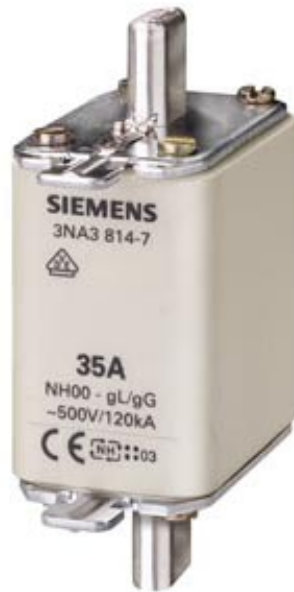
LV HRC FUSE LINK GL/GG WITH NON-INSULATED GRIP LUGS WITH FRONT INDICATOR SIZE 00, 35A, AC 500V/DC 250V