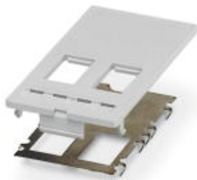
Front plate, plastic with shroud, for 2x RJ with modular system (Keystone)

Please be informed that the data shown in this PDF Document is generated from our Online Catalog. Please find the complete data in the user's documentation. Our General Terms of Use for Downloads are valid ( http://phoenixcontact.com/download )