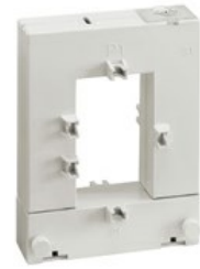
Current transformers DM1TA0500