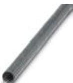
Stainless steel protective hose, 1 Pcs. / Pkt. = roll à 10 m