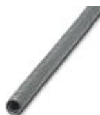
Galvanized steel protective hose, 1 Pcs. / Pkt. = roll à 10 m