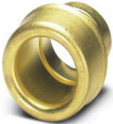
End sleeves as cable protection, made of brass

Please be informed that the data shown in this PDF Document is generated from our Online Catalog. Please find the complete data in the user's documentation. Our General Terms of Use for Downloads are valid ( http://phoenixcontact.com/download )