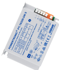
143482 POWERTRONIC INTELLIGENT PTi S 70/220...240 S