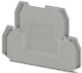
End cover, length: 80.1 mm, width: 2.2 mm, height: 57.4 mm, color: gray

Please be informed that the data shown in this PDF Document is generated from our Online Catalog. Please find the complete data in the user's documentation. Our General Terms of Use for Downloads are valid ( http://phoenixcontact.com/download )