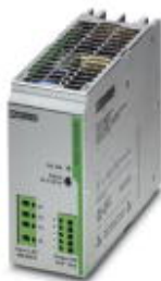
Primary-switched TRIO POWER power supply for DIN rail mounting, input: 3-phase, output: 24 V DC/10 A

Please be informed that the data shown in this PDF Document is generated from our Online Catalog. Please find the complete data in the user's documentation. Our General Terms of Use for Downloads are valid ( http://phoenixcontact.com/download )