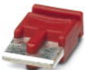
Single plug-in bridge, length: 6 mm, number of positions: 2, color: red

Single plug-in bridge - FBST 6-PLC RD - 2966236