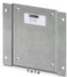
Mounting plate for SFNT switches

Mounting plate - FL PA SFNT 5-8 - 2891012