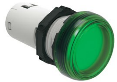
LED integrated monoblock pilot lights steady light LPML