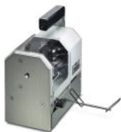
Automatic stripping and crimping device, 120 V version, for insulated taped ferrules 0.5 - 2.5 mm 2 in acc. with DIN 46228-4: 1990-10

Please be informed that the data shown in this PDF Document is generated from our Online Catalog. Please find the complete data in the user's documentation. Our General Terms of Use for Downloads are valid ( http://download.phoenixcontact.com )