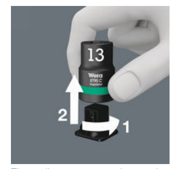
The all new smooth turning mechanism guarantees both secure and rattle-free storage, yet allows easy removal of the tool.