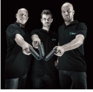
Whoever would have thought that the storage of sockets could be completely revolutionised and that someone could come up with a stylish belt with securely attached sockets that can still be easily removed.