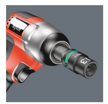
The Impaktor technology ensures above-average service life of the Impaktor socket wrench plug-ins even under extreme conditions.