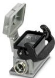
HEAVYCON box mounting base B10, with double locking latch, height 52 mm, with supports 2xM20 and protective cover

Please be informed that the data shown in this PDF Document is generated from our Online Catalog. Please find the complete data in the user's documentation. Our General Terms of Use for Downloads are valid ( http://phoenixcontact.com/download )